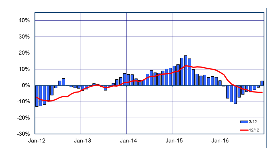
Note: 3/12 = Percent change of a three-month period compared to a similar period twelve months before 12/12 = Percent change of a twelve-month period compared to a similar period twelve months before